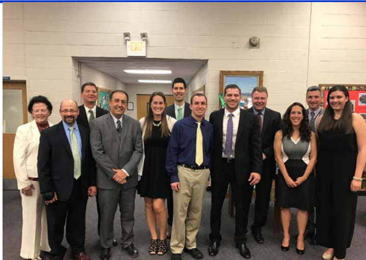
All of the 2016-2017 Teachers of the Year were honored at a Board of Education Meeting and received engraved golden apples.