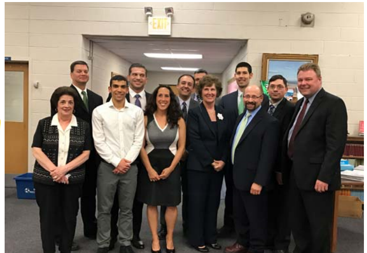
All of the 2016-2017 Excellence in Service Award recipients were honored at a Board of Education Meeting and received engraved golden apples.